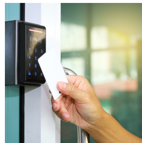
Access Control Systems