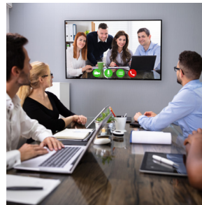
Audio/Visual & Video Teleconferencing